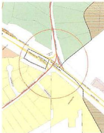
(3) Overton Road/Rocky Ridge Road.