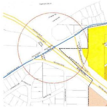
(2) Cherokee Road Gateway.