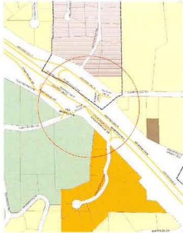
(6) Cahaba River Road.