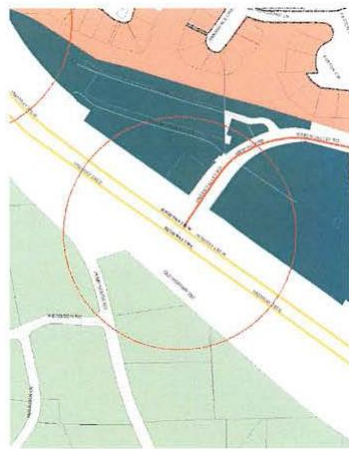
(5) Pump House Road.