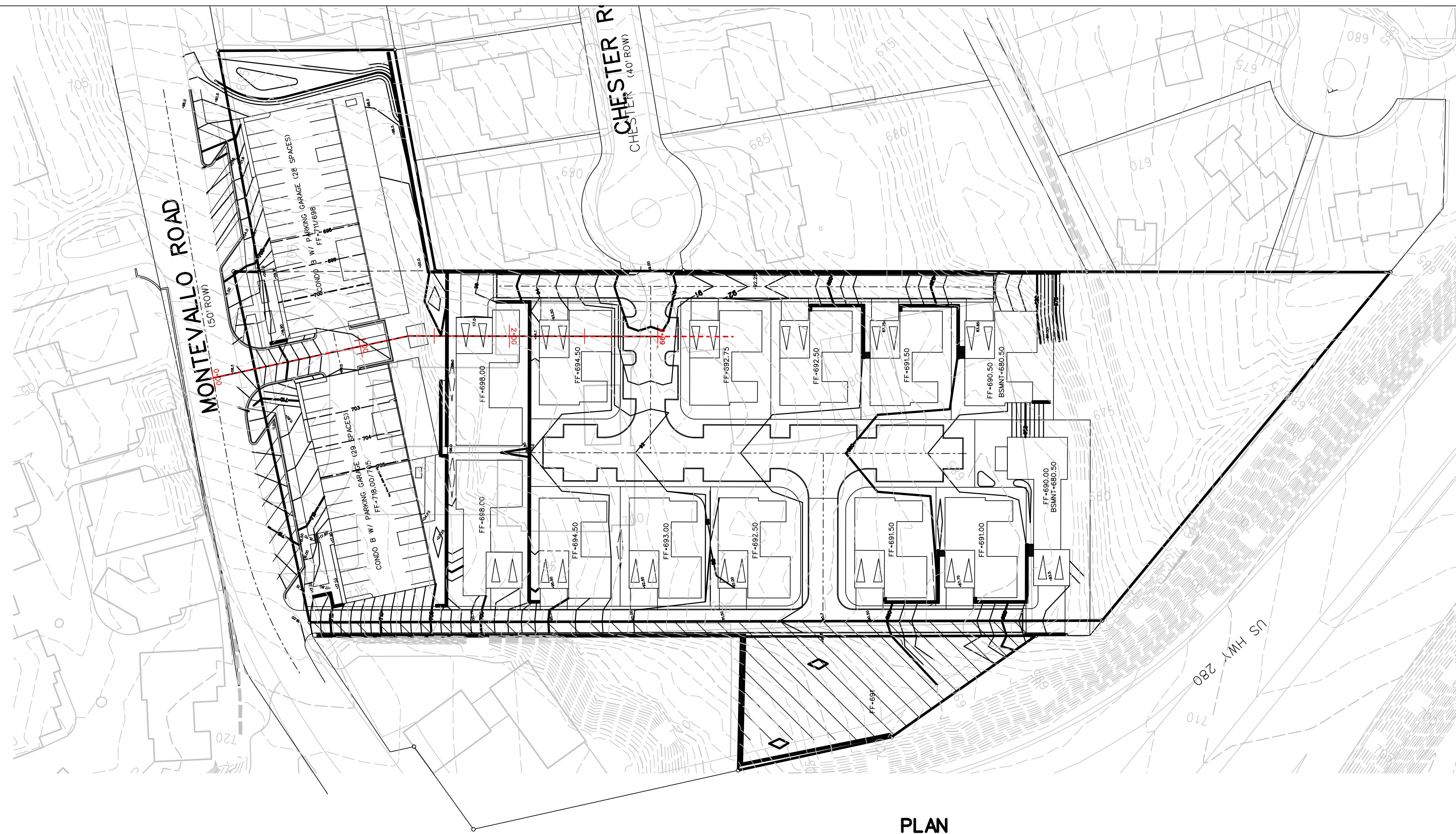
PLAN SCALE: 1" = 50'

UNDERGROUND UTILITIES SHOWN ON THIS MAP ARE FROM LOCAL UTILITY COMPANY RECORDS AND SHOULD BE FIELD VERIFIED IN THE FIELD PRIOR TO CONSTRUCTION.