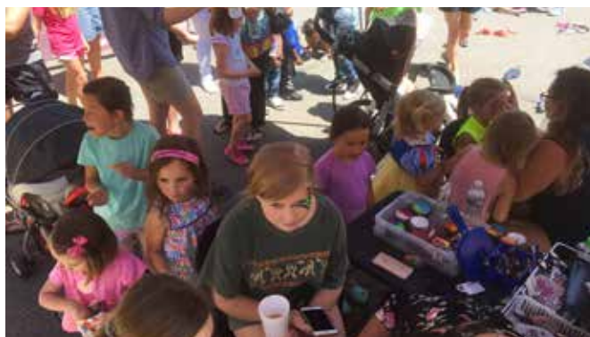
Kids lining up to get their face painted.