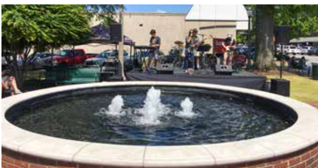
Rug Monkey performing on stage.