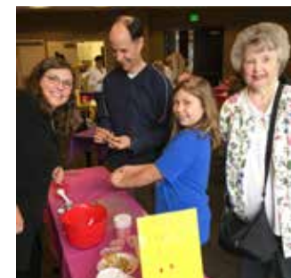
One of the library's most popular family programs involves parents and kids preparing food together in a Chopped! style challenge. Here, a family team competes in Candy Wars .