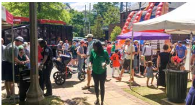
Residents enjoying the event.

On April 28th 2018, Mountain Brook had its first Citizen Appreciation Day as a way to give back to the residents we serve every day. The city wanted to have an event where the residents can learn about the city and all of the services that are provided in a fun and engaging way. The event was a great success. Thank you to everyone for coming and enjoying this day with us. We hope you enjoyed learning about your city and will be back next year.