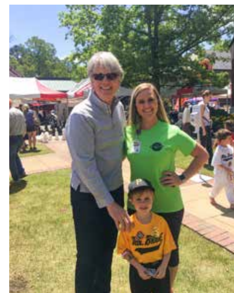
Mayor Welch enjoying the event.