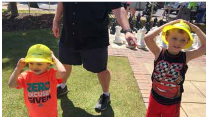
Kids with Public Works hats.