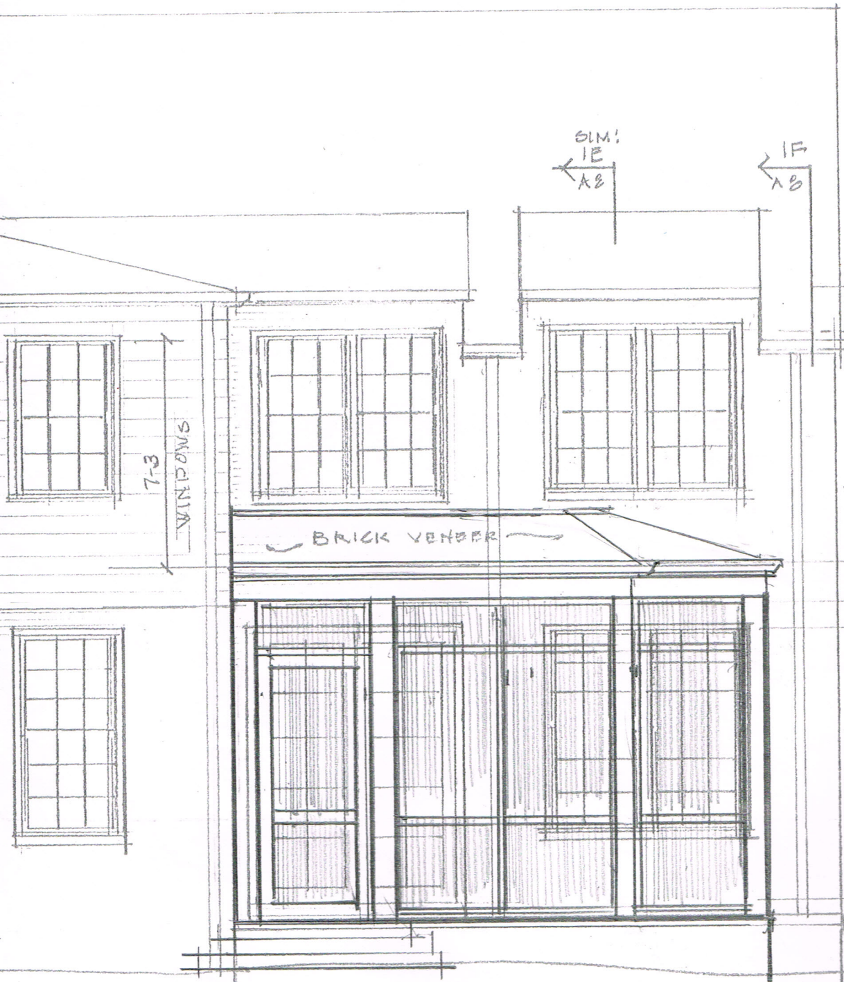
SCREENED PORCH RIGHT SIDE ELEVATION