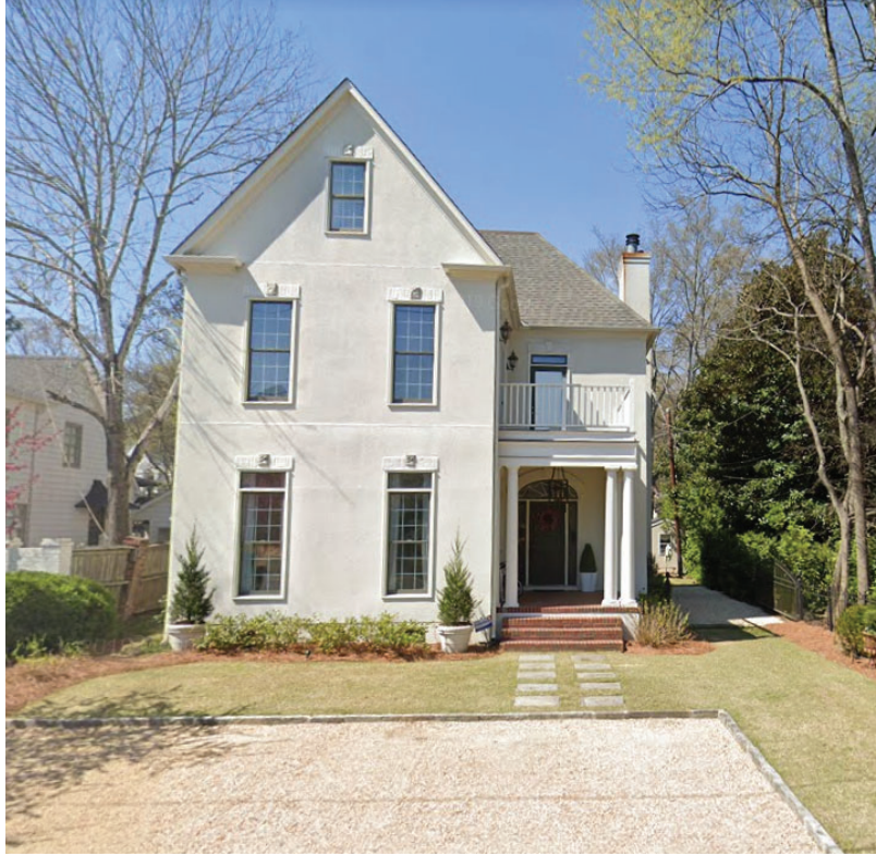
EXISTING FRONT ELEVATION 304 DEXTER AVENUE