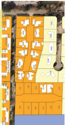
01 GIS TAX MAP EXCERPT SHOWING APPROX. ADDITION WALL NOT TO SCALE