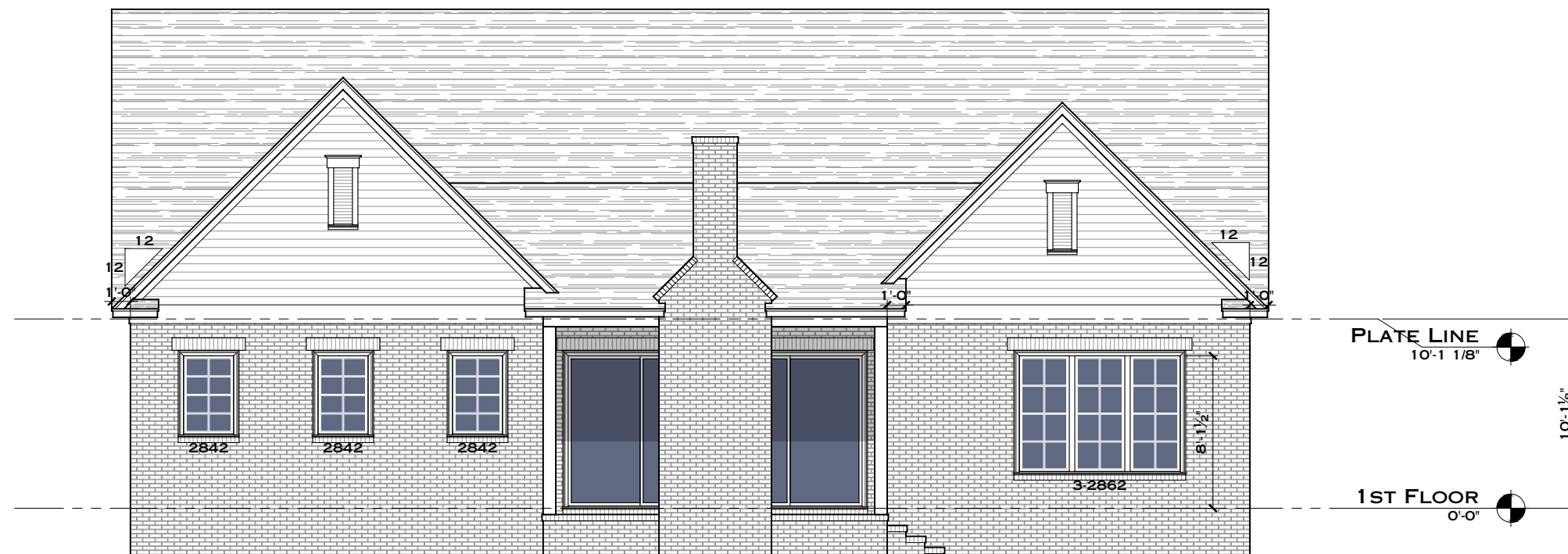
1 Rear Elevation A3.3 1/8" = 1'-0"