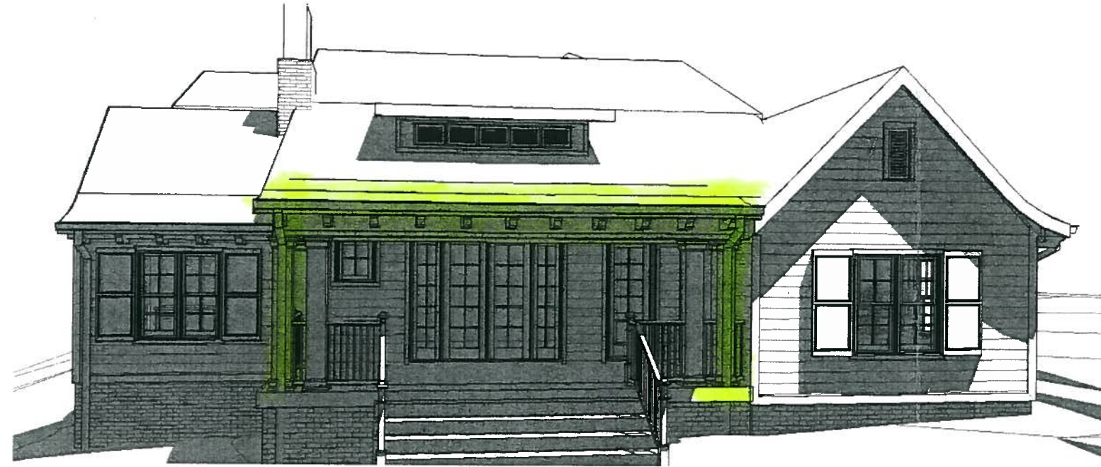
1 PERSPECTIVE VIEW FROM STREET scale: