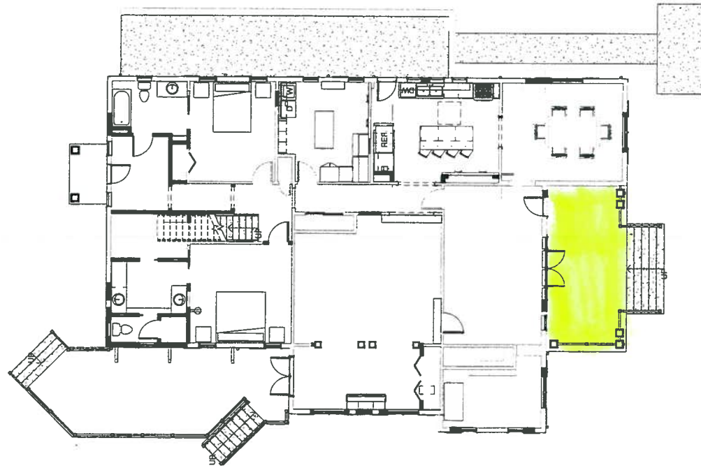
2 first floor scale: 1/8" = 1'-0"